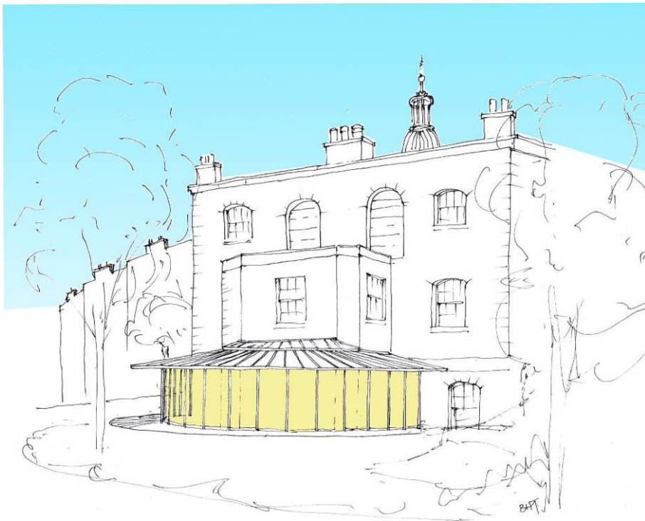
Artist's Impression of Garden Room